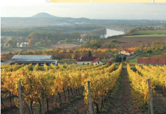
vineyards near Roudnice nad Labem