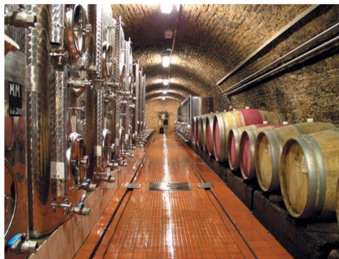
Venerie cellar of the Secondary viticulture school Valtice