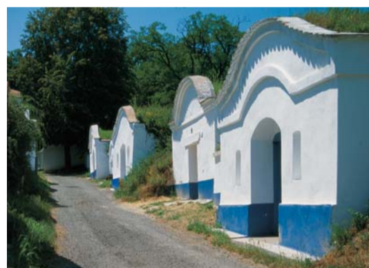
wine cellars in Píže

It is the smallest sub-region. The basaltic subsoil of the dry Most region gives wines a strong mineral content with smoky tones. The environs of Roudnice nad Labem and Žernoseky is composed of lime sandstones, loess and marl, which provides structural and solid wines. The most popular varieties are Müller Thurgau, Rhine Riesling, St. Laurent and Portugieser Blauer.