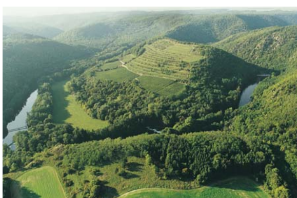
the Šobes vineyard in the Podjí National Park

Its cooler climate gives the prerequisites for full bodied and fresh aromatic white wines, especially on the typical gravel-sand sediments with localities of clay and loess in the Znojmo area, which involves varieties Valtelina Green, Müller Thurgau and Rhine Riesling. The Dolní Kounice area excels in red wines – above all Limberger and St. Laurent. Among the popular wine-growers' destinations is for example the Wine Cross Cellar in Přímětice, Šobes vineyard in the Podjí National Park and the ruins of Rosa Coeli monastery in Dolní Kounice.