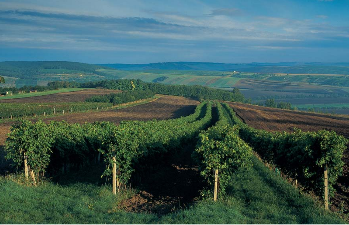
vineyards in Kobyly – The Velké Pavlovice Sub-region