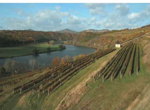
vineyards around Velké Žernoseky

www.wineofczechrepublic.cz www.vinazmoravy.cz www.vinazcech.cz