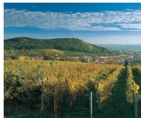
vineyards above Mikulov

The southern slopes of the Pálava Hills are the first ones in the entire Moravia where snow disappears after winter; they have one of the warmest climates. This was known already at the time of Roman soldiers, who once established vineyards there. Varieties as Italian Riesling, Chardonnay or Pinot Blanc do extremely well here. Also varieties of Sauvignon, Müller Thurgau, Rhine Riesling or Pinot Gris have good results in this area. Pálava gave its name to the newly bred variety, which excels in aroma. Limy soil – clay, claystone and loess – created on the slate sediments give the prerequisites for sparkling wines. The local conditions are suitable for blue varieties. The chateau in Valtice houses the National Wine-growing Centre. Pálava gave its name to the newly bred variety, which excels in aroma.